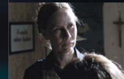
Tyyne (Kati Outinen, b. 17.8.1961)